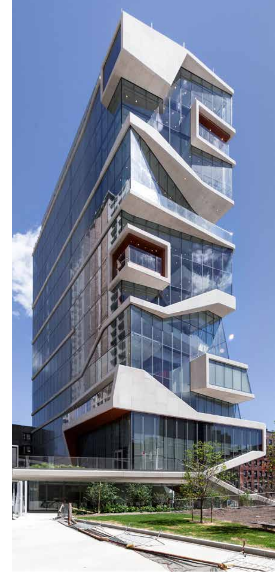
The Roy and Diana Vagelos Education Center at the Columbia University Medical Center.

A striking illustration is the Seminole Hard Rock Hotel & Casino, currently under construction in Hollywood, Florida. The building will stand at 450 feet tall and will be shaped like the body of a guitar. To replicate the curvature of a guitar, floor slabs are deeply set back from floor to floor and columns could not be arranged in a grid. Nevertheless, post-tensioning offered the flexibility to "sweep" or curve the tendons